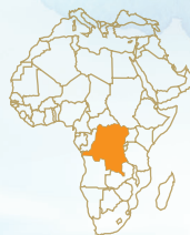
Democratic Republic of Congo